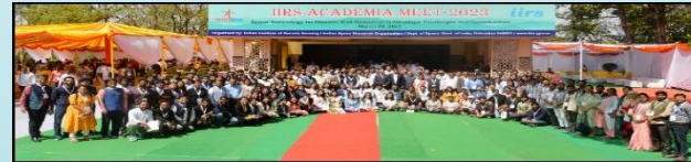
IIRS Academia Meet 2023

Indian Institute of Remote Sensing (IIRS) under Indian Space Research Organisation (ISRO), Department of Space, Govt. of India is a premier Training and Educational Institute set up for developing trained professionals in the field of Remote Sensing, Geoinformatics and GNSS Technology for Natural Resources, Environmental and Disaster Management. Formerly known as Indian Photo-interpretation Institute (IPI), founded in 1966, the Institute boasts to be the first of its kind in entire South-East Asia. While nurturing its primary endeavor to build capacity among the user community by training mid-career professionals, the Institute has enhanced its capability and evolved many training and education programmes that are tuned to meet the requirements of various target groups, ranging from fresh graduates to policy makers including academia. IIRS also conducts e-learning programme on Remote Sensing and Geo-information Science ( http://elearning.iirs.gov.in ).